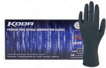
Featured: Optify, Koda, Enov-8 gloves